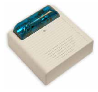
HS2B Horn / Strobe