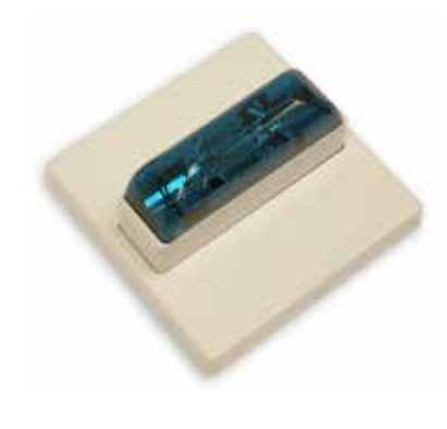
S2B Strobe Only

For added security in your facility, Detex offers a line of additional strobes and horn/strobe combinations. When the environment is noisy, these will draw your attention to possible breaches in your security.